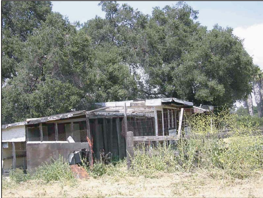
Photograph C: Looking northeast at a shed and kennel from within the Project Site near the southern property line.